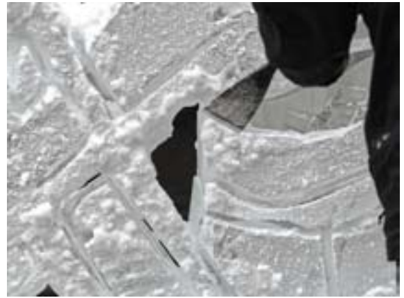
#2: Smoothing the Front