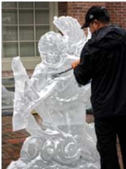
#3: It's Taking Shape