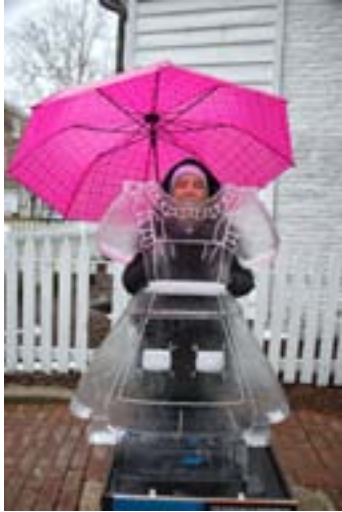
Top three photos by Vincent Ferrari