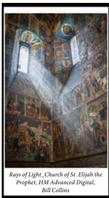
Rays of Light_Church of St. Elijah the Prophet, HM Advanced Digital