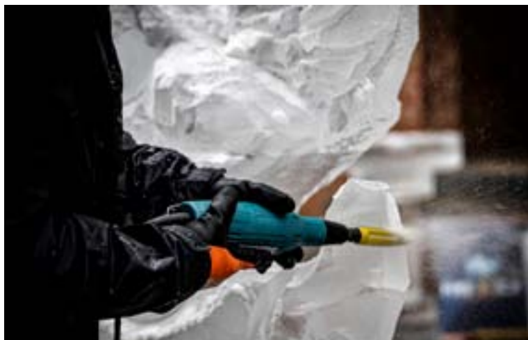
Bottom three photos