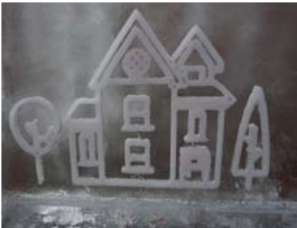
Leslie Ferrari: Ice Bench Carving