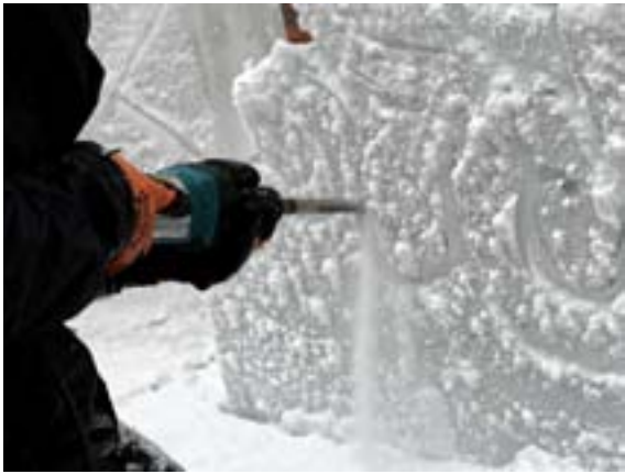
#1: Drilling the Block