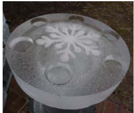
Leslie Ferrari: Patio Table