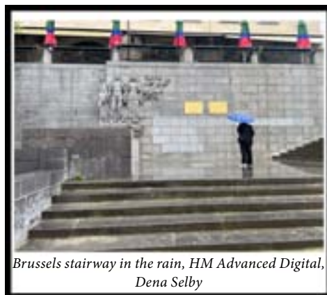
Brussels stairway in the rain