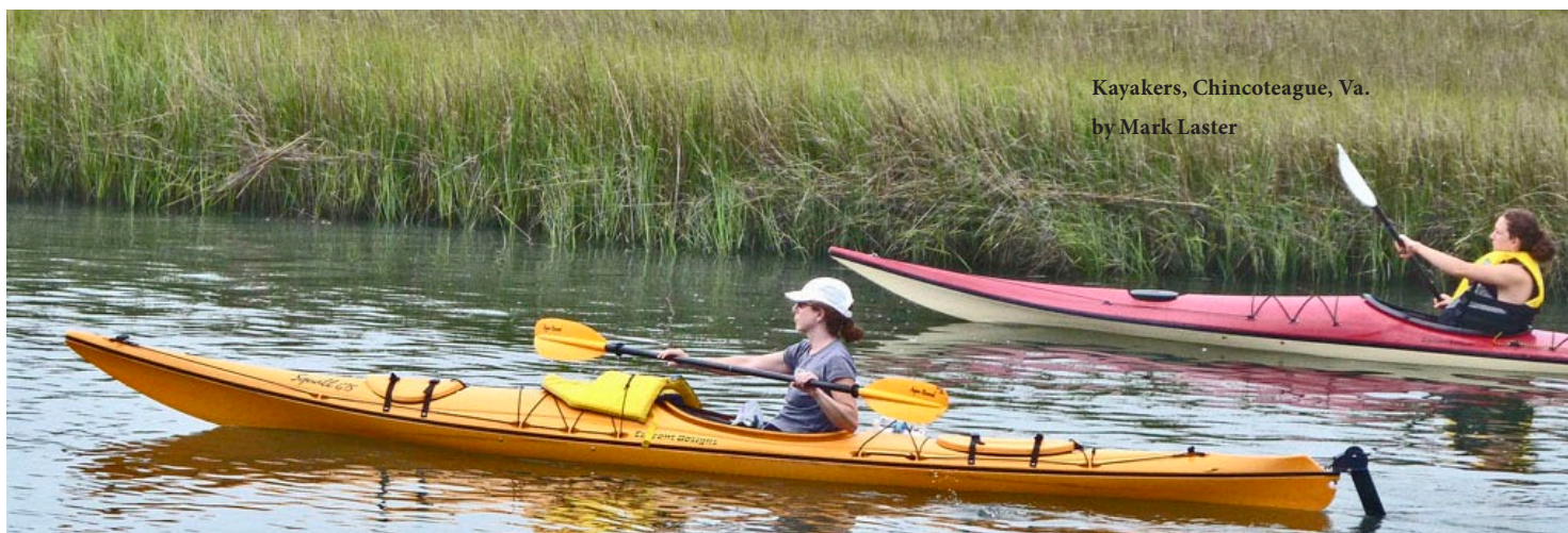
Kayakers, Chincoteague, Va.