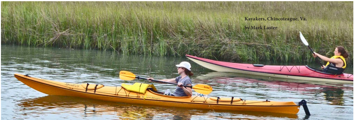
Kayakers, Chincoteague, Va.