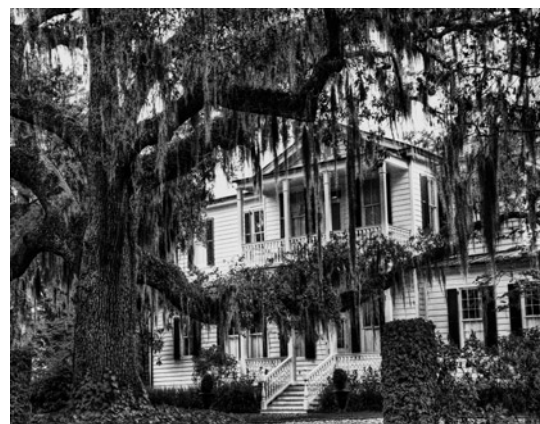
Beaufort Mansion by Pat French, Honorable Mention in Novice Monochrome