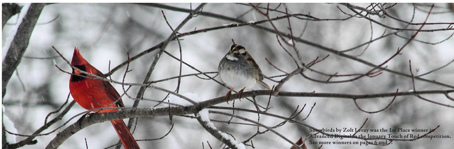
Snowbirds by Zolt Levay was the 1st Place winner in Advanced Digital in the January Touch of Red competition. See more winners on pages 6 and 7.