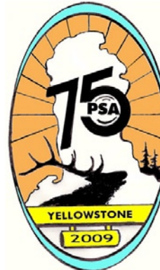
West Yellowstone, Montana September 20 - 26, 2009