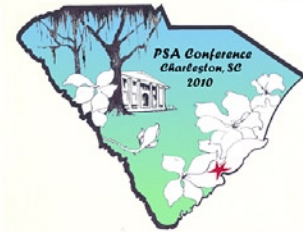
Charleston, South Carolina October 3 - 9, 2010