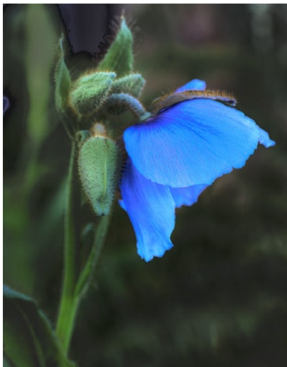
(Top to bottom) Dragonfly, HM Novice Digital, Kaylee Kornn; Blue Poppy, HM Novice Digital, Pat French.