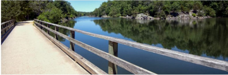
C&amp;O Canal Towpath