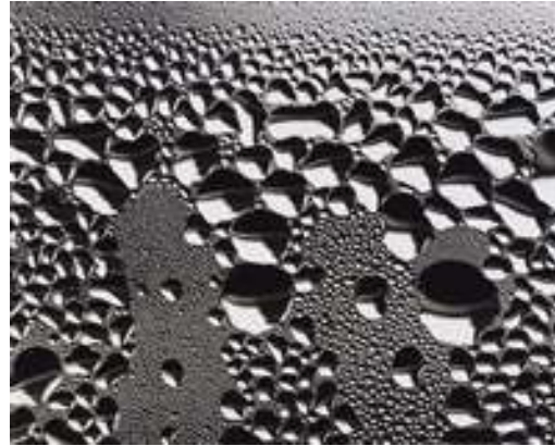
Droplet Formation on Windowpane, 1998