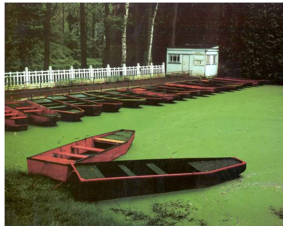
Punts, Les Quesnoy, France, 1983