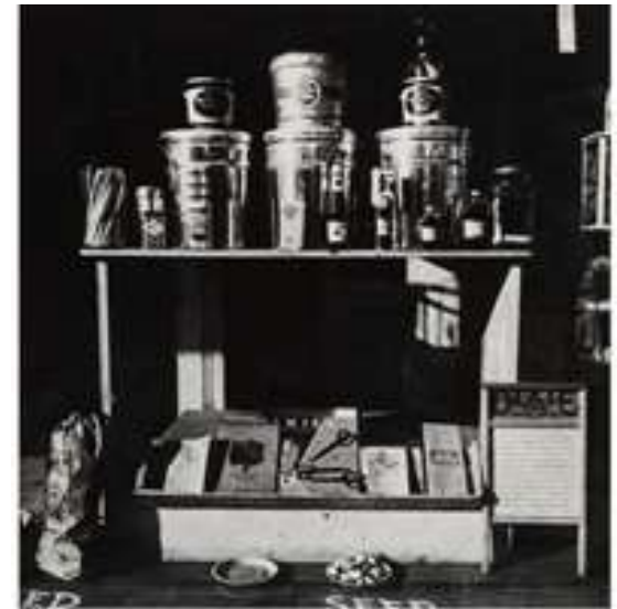
Store Front, 1940