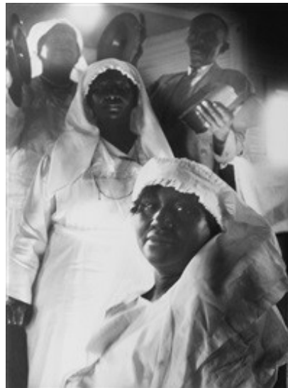
Preacher and Leaders of the Holiness Church, 1939

Born in 1909 – Eudora Welty, Pulitzer prize-winning author and photographer, in Jackson, Mississippi, U.S.