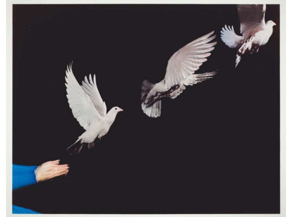
Pigeon Released – 1965