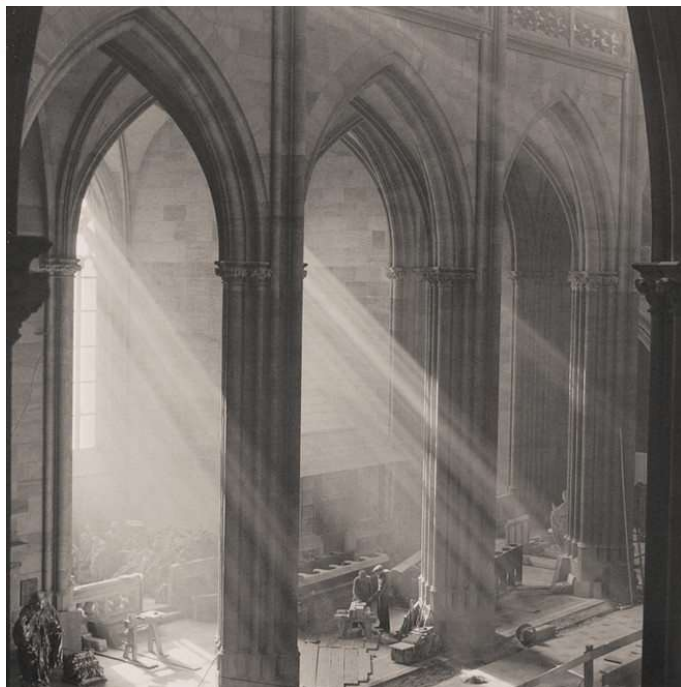
St Vitus' Cathedral (ca. 1928)

His projects include "Panoramas", "Nocturnes", "A Walk in the Magic Garden", "Vanished Statues", "Memories". From the 1960s until his death in 1976, "Labyrinths" captured the disorder in his home as a way of finding meaning in the everyday surroundings of his life, and "Sad Landscapes" revealed the ravages of mining in the Soviet era.