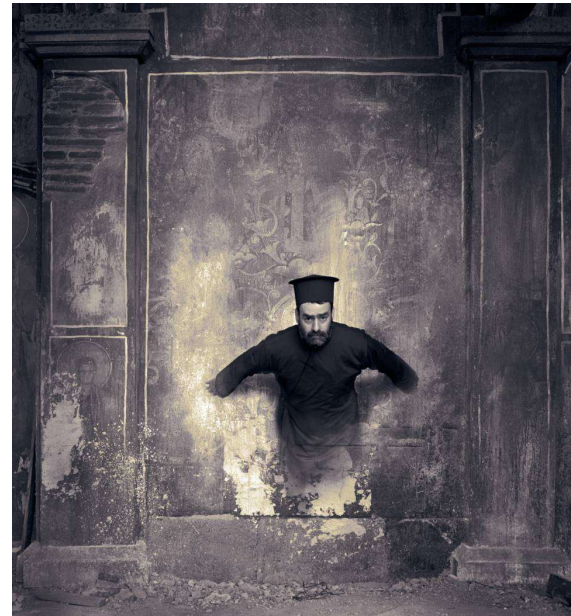
Serie Milagros Joan Fontcuberta 2002

“Photography is a tool to negotiate our idea of reality. Thus, it is the responsibility of photographers to not contribute with anaesthetic images but rather to provide images that shake consciousness. “