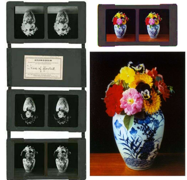
Kromogram No 1 Vase of flowers, circa 1896