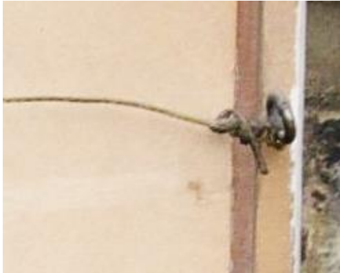
Eye Hook on Top/Face of Frame: