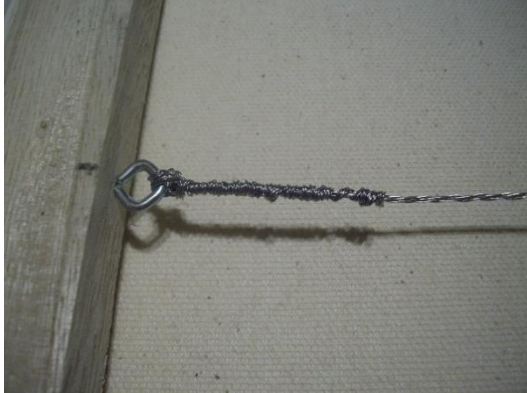
Eye Hook Inside Frame: