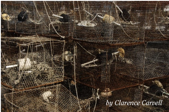
by Clarence Carvell