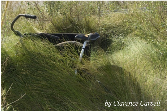
by Clarence Carvell

Club Members Take On Smith Island Maryland (September 2008)