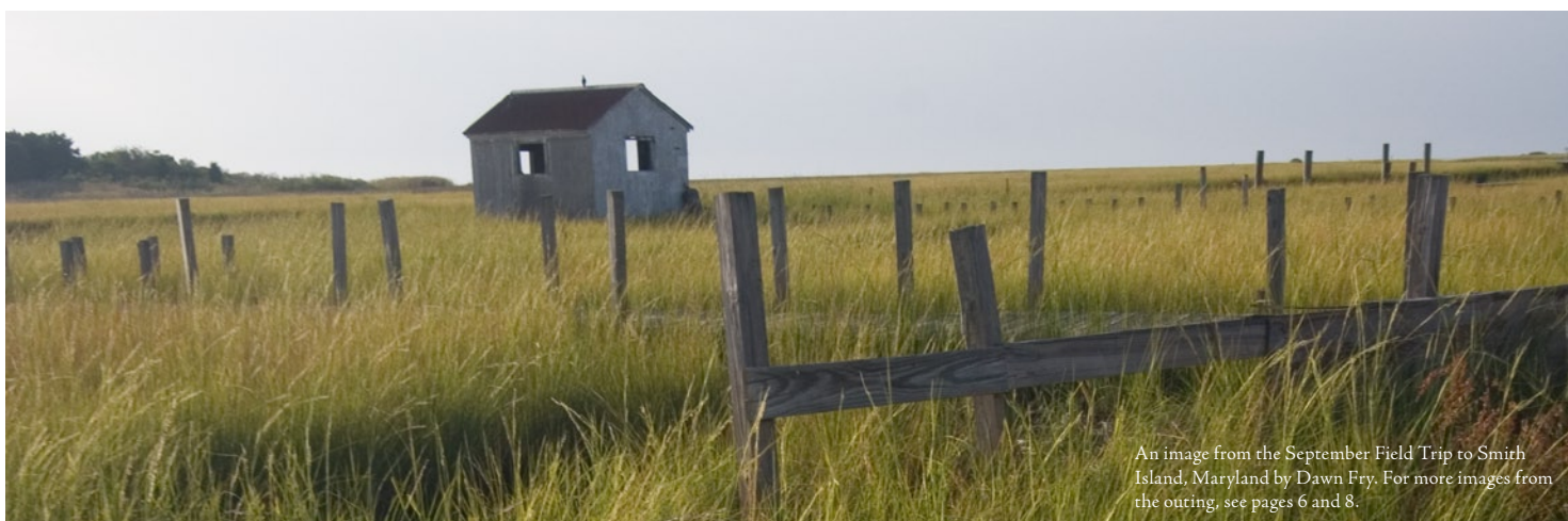
An image from the September Field Trip to Smith Island, Maryland by Dawn Fry. For more images from the outing, see pages 6 and 8.