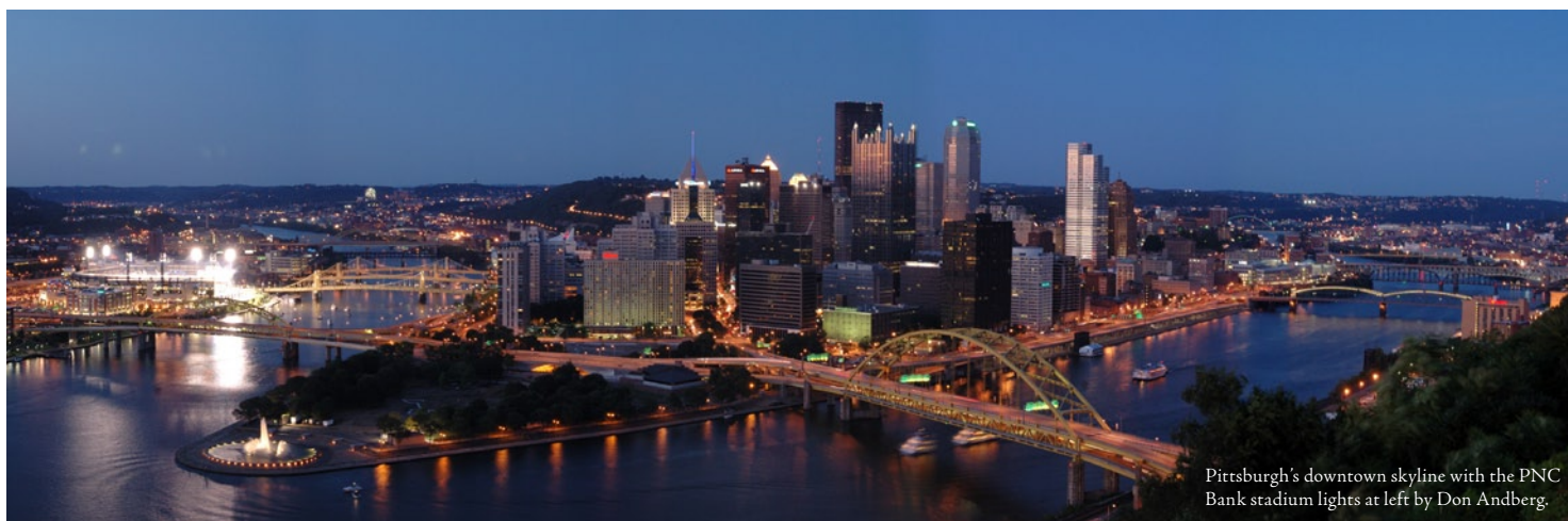
Pittsburgh's downtown skyline with the PNC Bank stadium lights at left.