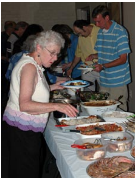
Club members and their guests dig in to the delicacies at the annual End-of-Year dinner held last June in Greenbelt